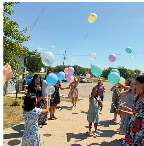
Celebrating with a balloon release!