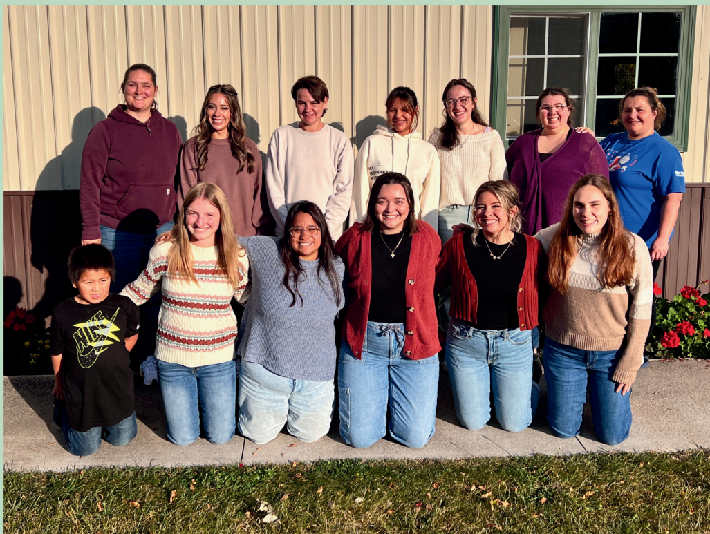
Former and current moms and housemothers at our Home in October