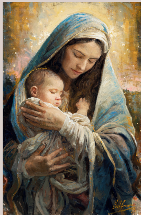
Painting: La Madre de Dios

Reflect further, now, just how Jesus and Mary were always connected. So then, if we stay close to Mary, we will always be close to Jesus. Following through the example of their lives, we will be graced as we begin the New Year of Faith and make our Consecration to Our Lady of Guadalupe on Her Feast, December 12th. After that we celebrate Christmas, and we observe and learn from Mary's virtues. She most ardently lived both with humility and deep devotion to Her Son, Our Lord.