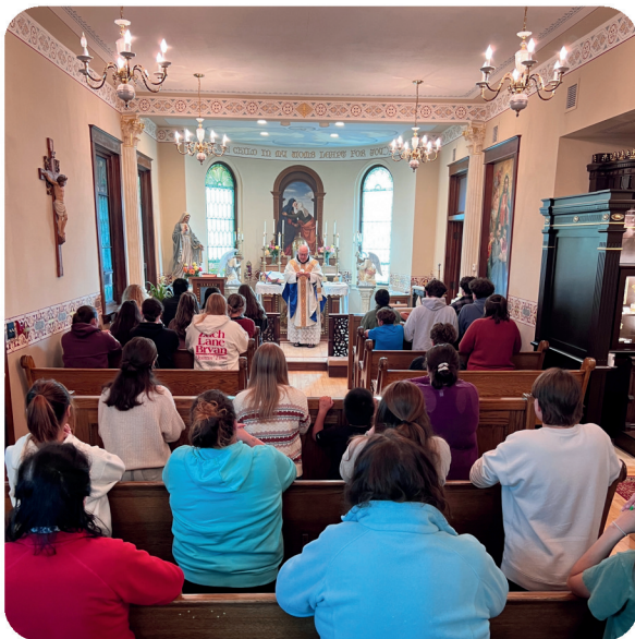
Mass in the Visitation Chapel